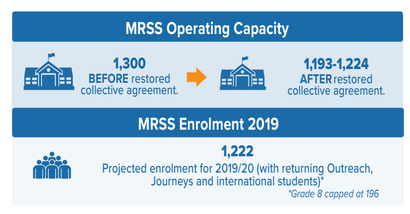
Figure 3: The graphic above shows MRSS operating capacity (before and after the restored collective agreement) and projected enrolment for 2019/20.

As figure 4 shows, by 2020/21 MRSS is forecasted to have approximately 1,183 students enrolled. By the 2022/23 school year, this number is anticipated to decrease further to 1,052 students. This projected number includes the Outreach and International Education student population.